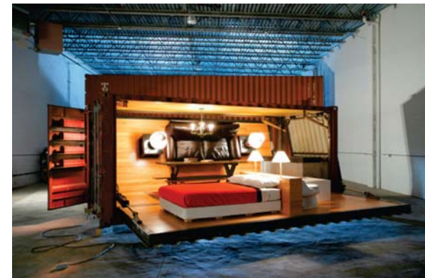
Push Button House